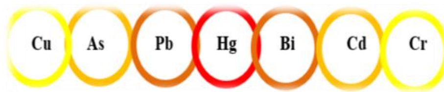
The most toxic heavy metals in cosmetics